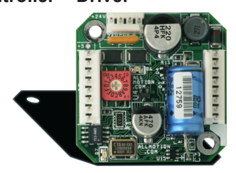
Model EZ17 actual size